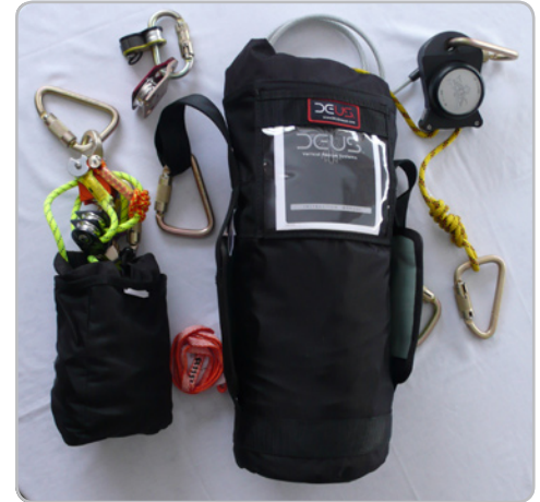
Available as part of complete Escape & Rescue Kits.

DEUS Rescue delivers innovative professional rescue solutions worldwide. For more information, visit www.DEUSrescue.com .